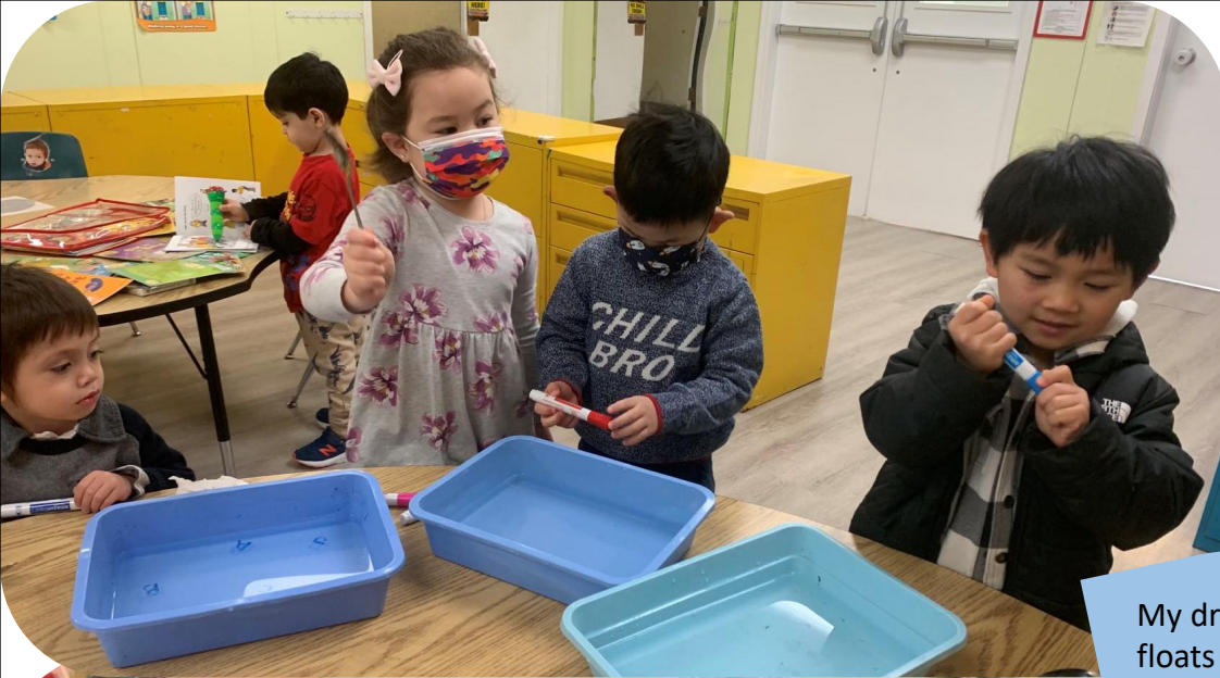
My drawing floats on water.