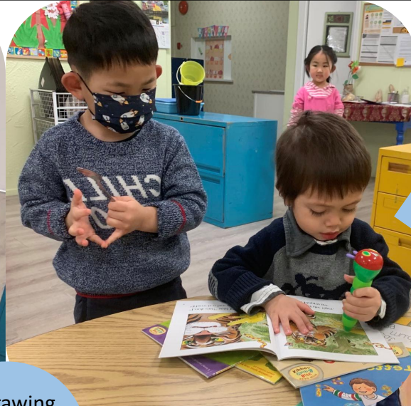
"Caterpillar" reading pen