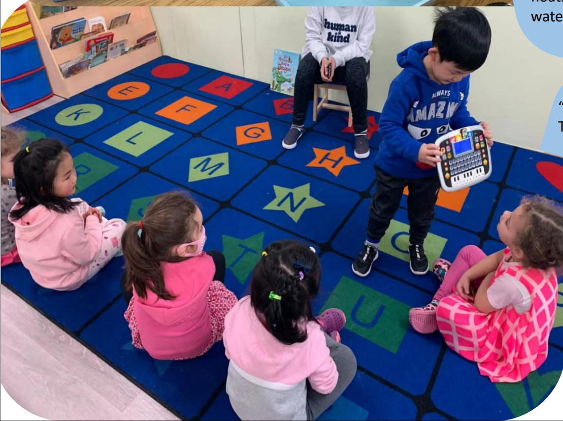
"Show and Tell"